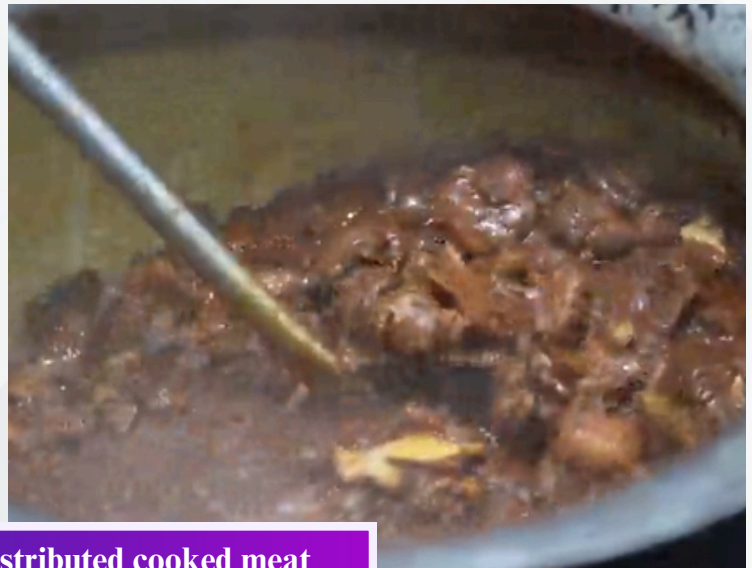
Distributed cooked meat among the vulnerable families.