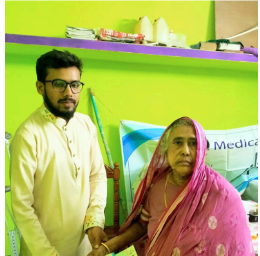
Our dedicated volunteer lends helping hands to ensure better support and care for the patients.