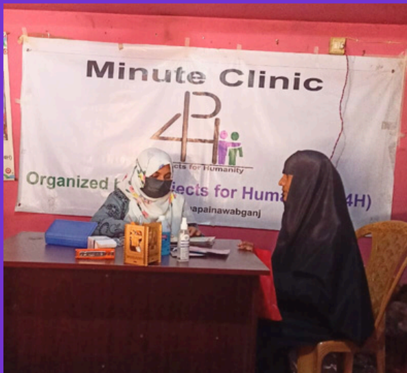
Women get the opportunity to discuss their concerns with a female doctor more comfortably.