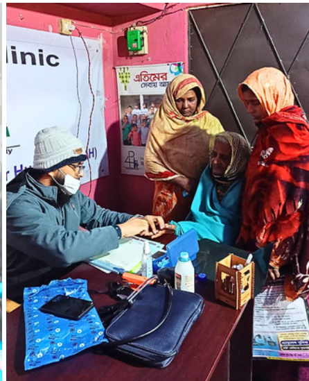
From the distant villages, women and children gather in hope, patiently awaiting their turn for medical care—a testament to the power of community and compassion. Organized by Projects for Humanity, this free medical camp bridges the gap in healthcare access, ensuring no one is left behind in their journey toward health and dignity.