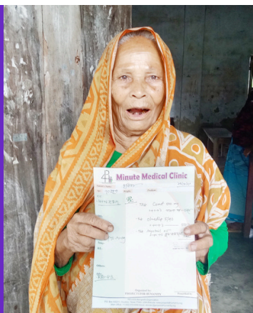
A strong testament to the commitment of free medical treatment initiative as an elderly woman holding her prescription, a symbol of care and wellbeing that ensures better health in all ages.