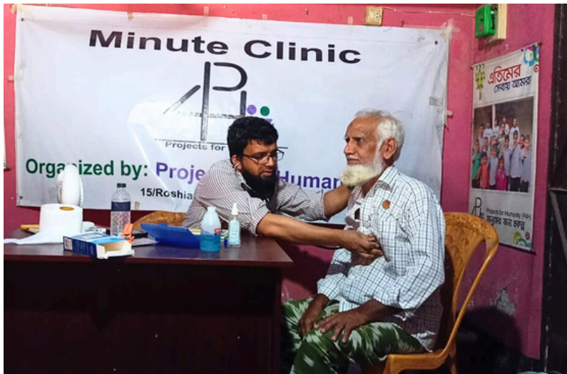
Medicine for the Body, Care for the Soul: An elderly man receives the gift of care and hope, showcasing our dedication to serving humanity.

Glimpses of the Medical Campaigns in Different Districts