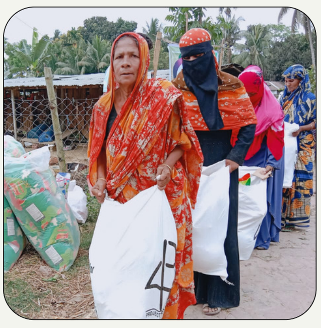
Ramadan Food Basket Distribution to Rohingya people at Cox-Bazar