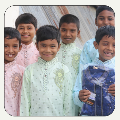
Group-03: Dress Distribution among Creating Champions Students