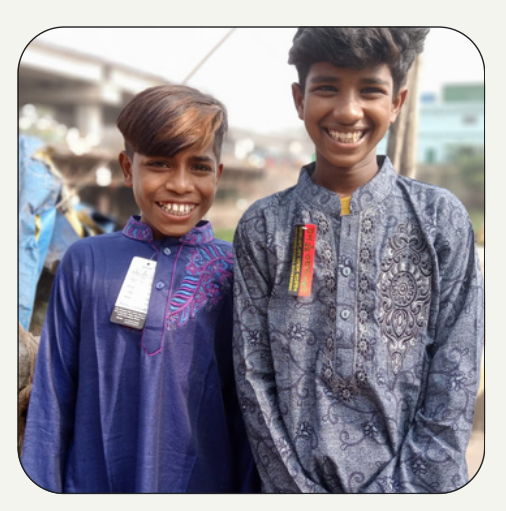
Group-02: Dress Distribution among slum children's