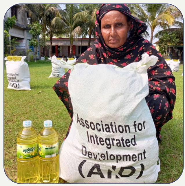
Ramadan Food Basket Distribution to Tiger widow, Khulna