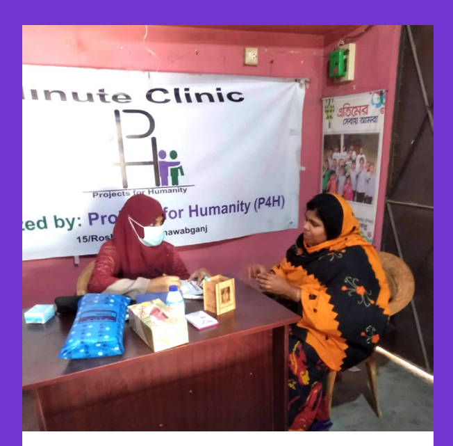
Women get the opportunity to discuss their concerns with a female doctor more comfortably.