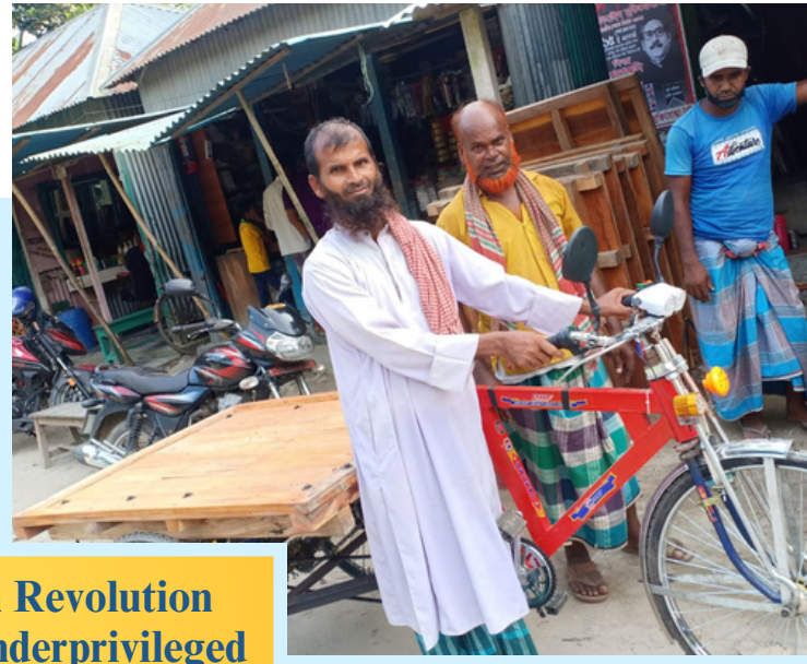
P4H's Rickshaw/Van Revolution Transforms Lives of Underprivileged Individuals & Family