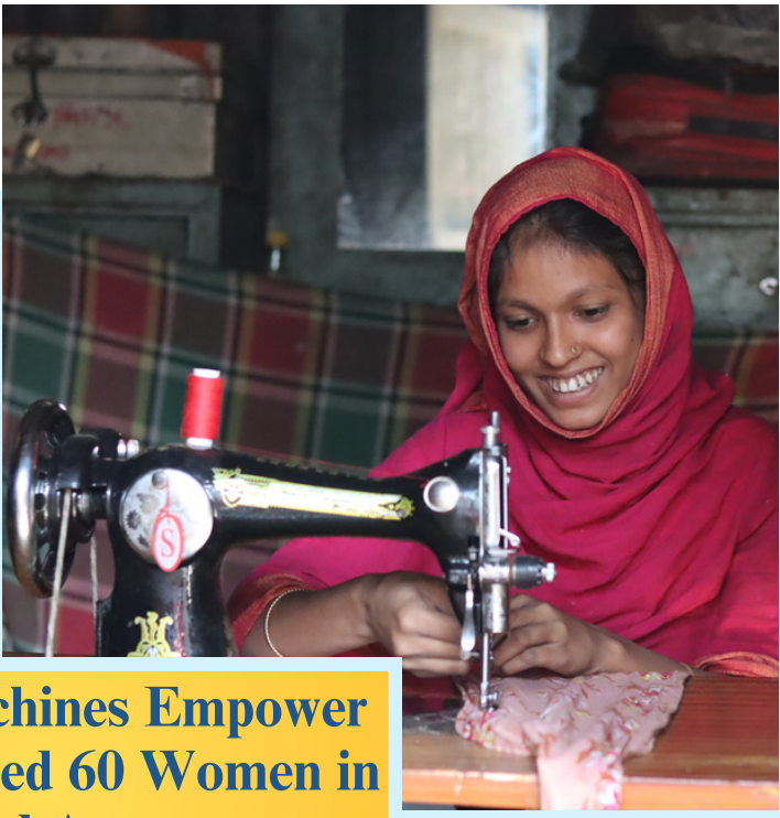
Sewing Machines Empower Disadvantaged 60 Women in Rural Areas