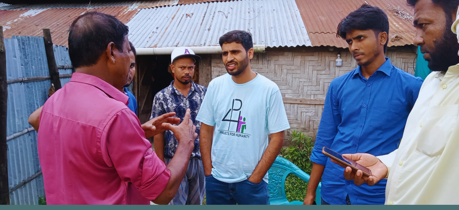
Image: P4H's president met the families of the victims and expressed his condolences.