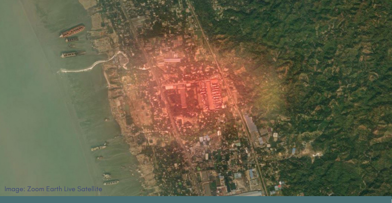
All ravaging red: Sitakunda depot fire from satellite