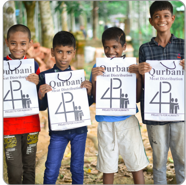
We distribute not only packets of meat but also the joy of packets among people who come from far and wide to collect our Qurbani Meat.