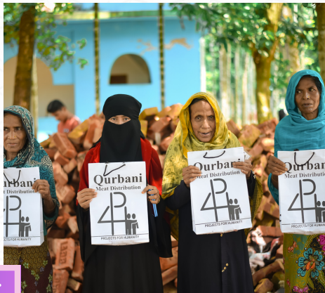
The joy of Eid and the taste of meat were enjoyed by over 1,000 Rohingya people.