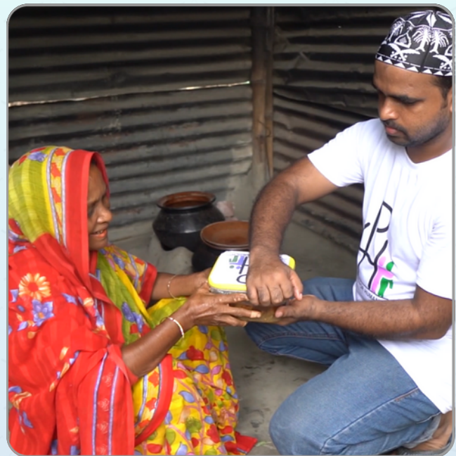
We ensure that elderly men and women can savor the pleasure of tasting meat without hesitation or shyness by personally delivering it to their homes