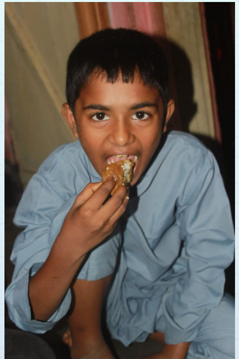
We prepared meat for them, recognizing that they have hearts just like us and a desire to celebrate Eid with their families, just as we do.